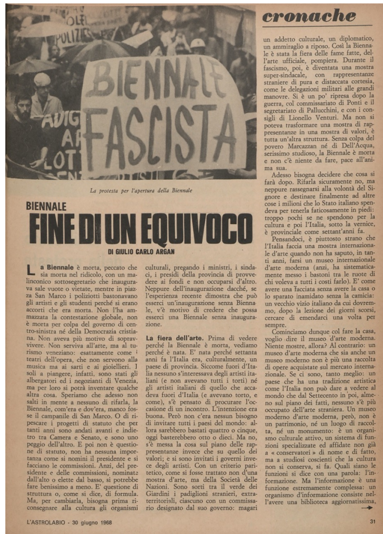
Giulio Carlo Argan's article, 'The Biennale and the End of a Misunderstanding', published on 30 June 1968 in the magazine L'Astrolabio .