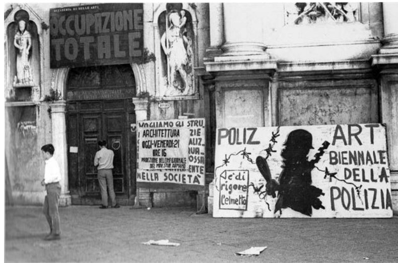
Occupation of the Fine Art Academy in Venice, June 1968.

An independent “Boycott the Biennale Committee” handed out leaflets inviting artists to withdraw their works and abandon the exhibition. Some representatives of national pavilions such as France, Norway, and the Netherlands started to suggest closing in protest at the excessive police presence. The museums and collectors who had agreed to lend works for 1968’s main historical exhibition Lines of Contemporary Research: from Informal Art to the New Structures ( Linee della ricerca contemporanea: dall’informale alle nuove strutture ) were uncertain as whether to lend them, fearing they could be damaged. Just a week before the opening, only forty percent of the art works had arrived. This delayed the show’s opening until July.