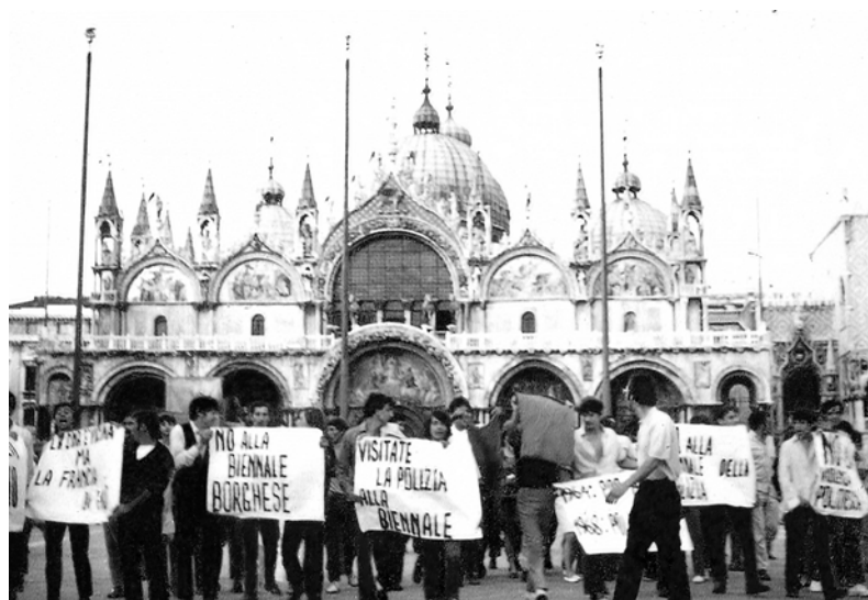
Sit-in of art students and artists in St. Mark's Square, June 1968.