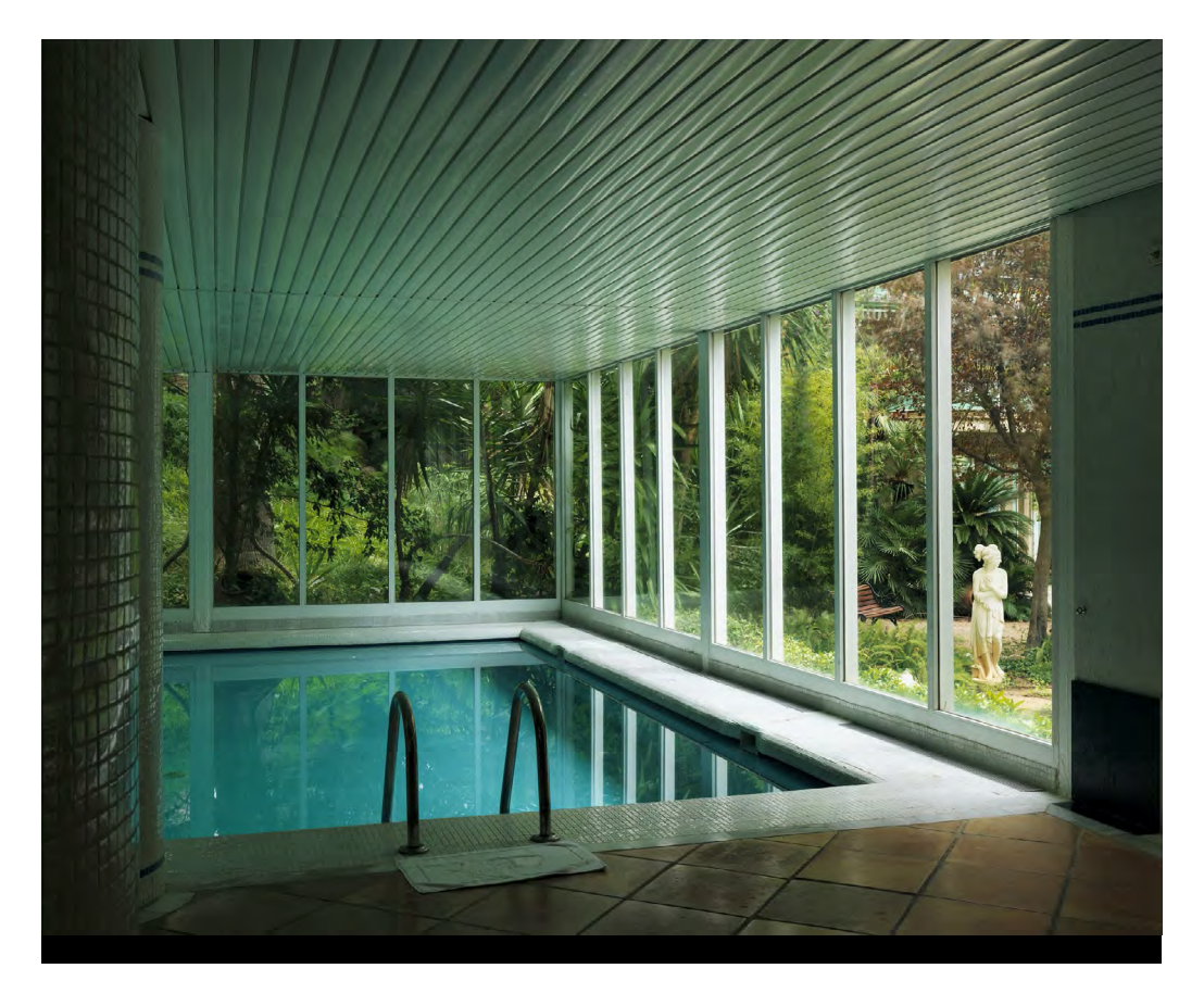
FIG. 1 Edmund Clark, Swimming Pool in the Hotel Gran Meliá, Palma de Mallorca , 2011–2015, photograph (digital print), 28.0 x 35.0 cm (in publication).