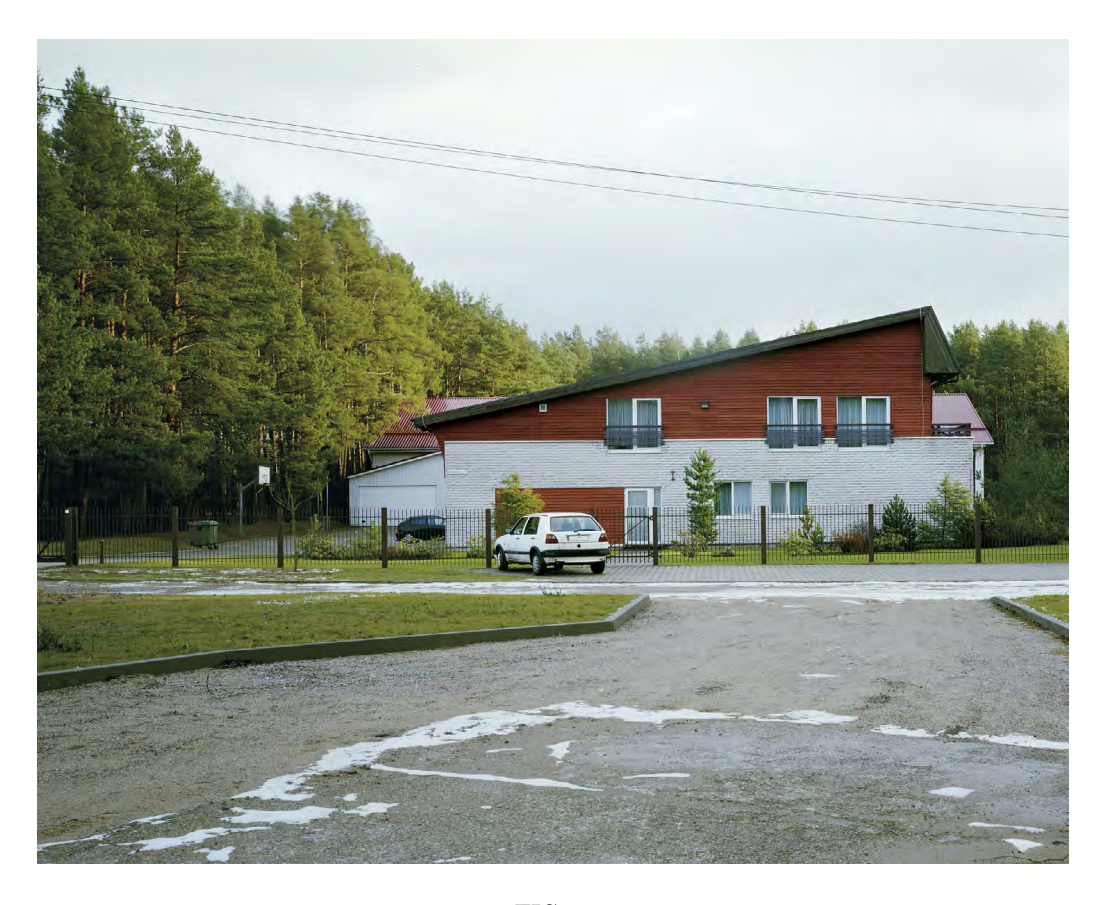
FIG. 3 Edmund Clark, The Facility at Antaviliai, Front View, 2011–2015, photograph (digital print), 15.5 x 24.2 cm (in publication).