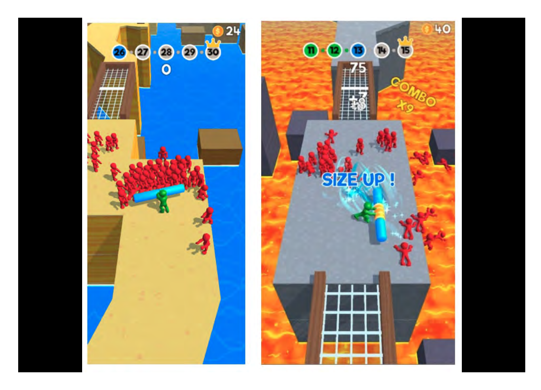
FIG. 5 Screenshots of Voodoo Games, Push 'em all, v. 1.10 \odot 2019 OHM Games SAS.