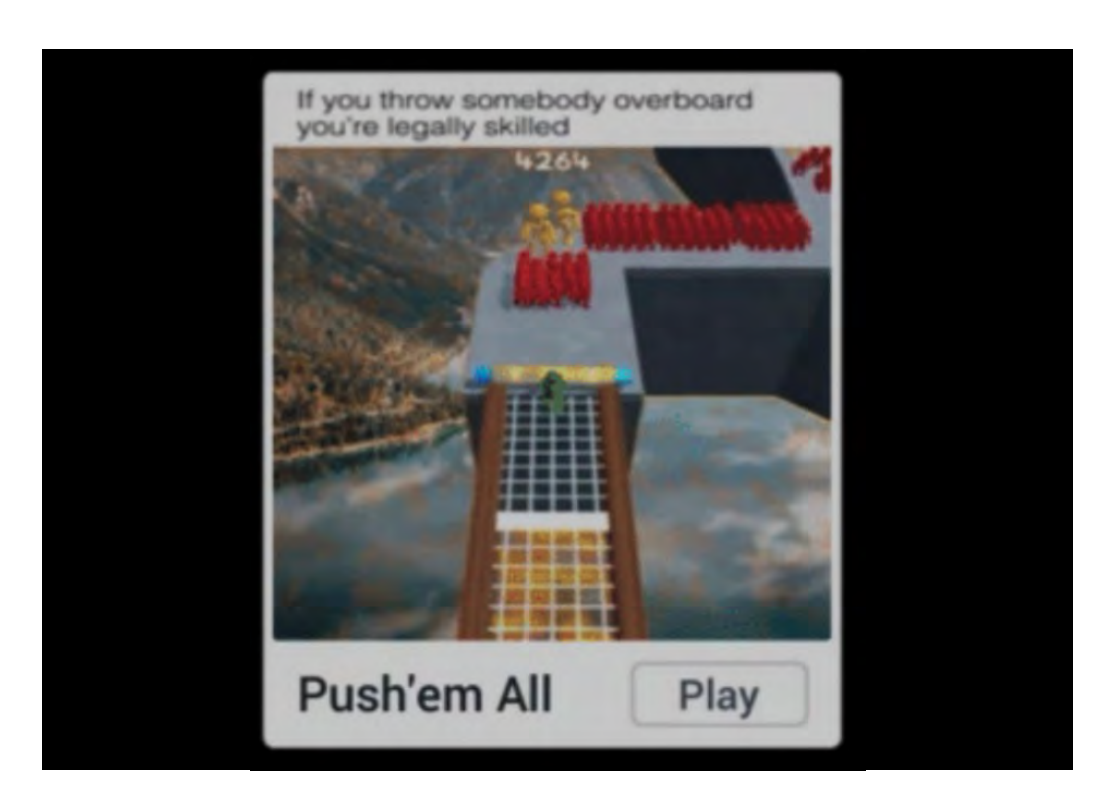
FIG. 6 Screenshot of Voodoo Games, Push 'em all, v. 1.10, \odot 2019 OHM Games SAS.