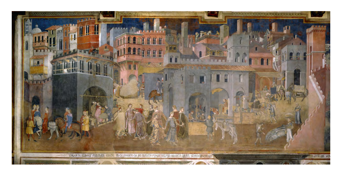
{\bf FIG.~1} Ambrogio Lorenzetti, \it Effects~of~Good~Government~in~the~City,~1338-39,~fresco,~Palazzo~Pubblico,~Siena.}

dimishing into the distance with the continuity of natural space." This sense of three-dimensional space, and public participation in it—trade, family life, pleasure and public discourse are to be found in every corner of the happy town—are not merely represented. They form the argument of the triptych as a whole: "good government" is not merely a moral obligation or spiritual virtue. It is valued precisely for its effects, principal amongst which are the flourishing public spaces which Lorenzetti depicts. The figure of Securitas stands guard over the city. Her purpose is not to safeguard the established order or to empty the public square. On the contrary, it is to protect and ensure their operation. On the facing wall, the effects of "bad government" are the opposite. Under the figure of Timor (fear), the city is surrendered to frenzied violence and division: shuttered windows, dilapidated buildings, and a city emptied of all life, save soldiers and brigands.