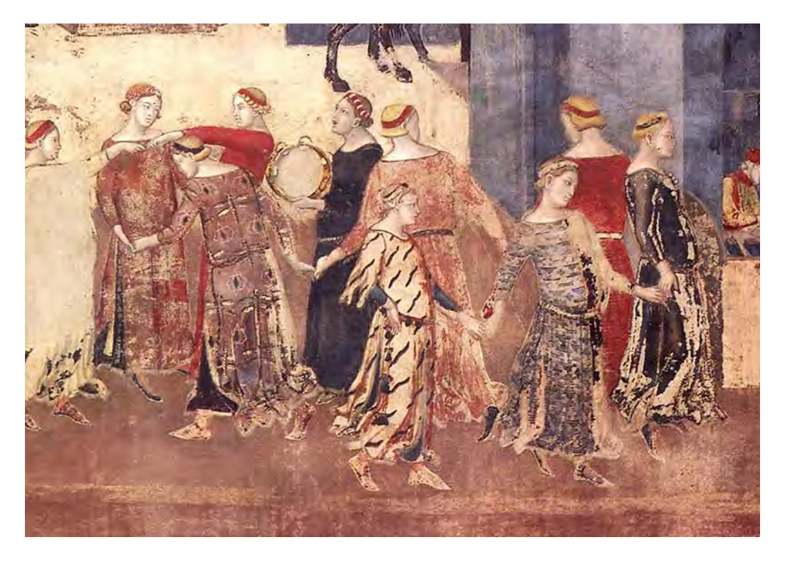
{\rm FIG.~2} Detail of Ambrogio Lorenzetti, Effects of Good Government in the City, 1338–39, fresco, Palazzo Pubblico, Siena.

into the distance according to its distance from them; hence the strange fact that figures on the far right are much smaller than those on the far left, in a manner that could never, for example, be countenanced by the painters of the Italian Renaissance or the Dutch golden age.<sup>21</sup> And so too the source of light in the image is not natural. It pours out from the dancers themselves, illuminating the right-hand side of those to their left and the left-hand side of those to their right.<sup>22</sup> All the "effects of good government," all the benefits of public life, the very light by which we see them—come from the dancers and the dance (fig. 2).