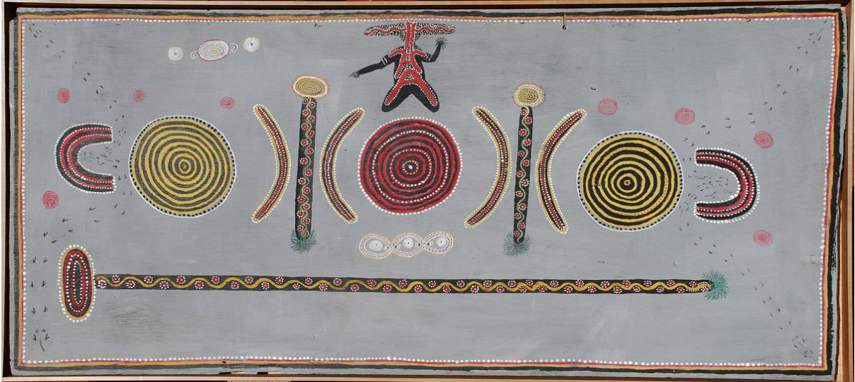
Fig. 4. Kaapa Tjampitjinpa, Men's Ceremony for the Kangaroo, Gulgardi , 1971. Watercolour on plywood, 61 x 137cm, Alice Springs, Araluen Arts Centre.

of 1971, the resulting prize money became a catalyst for Kaapa's countrymen to take up the brush. 16