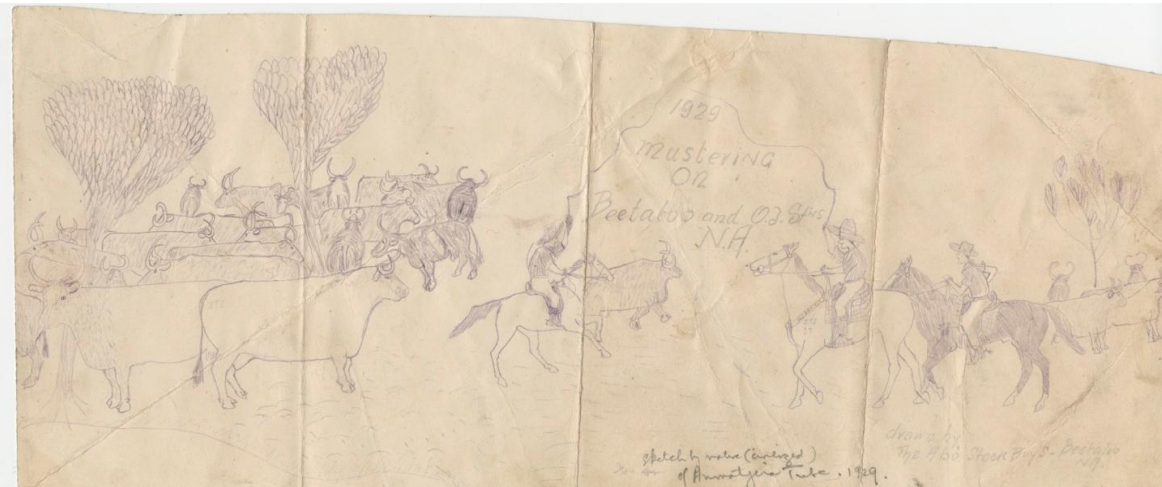
Fig. 5. Unknown (Anmatyerr stockman), Mustering on Beetaloo and O.T. Stations, Northern Australia , 1929. Pencil on paper, Adelaide, South Australian Museum, A1038 Acc 268.

depots. Whilst this may apply to most Western Desert communities like Kintore and Kiwirrkurra, on the other hand, the Anmatyerr, Alyawarr and Arrernte people to the east have experienced a far more varied intercultural history. Cattle stations had been operating on Anmatyerr land since the late 1800s and since the 1890s generations of men have grown up working as stockmen or occasional labourers. These people, working for rations and the ability to stay on their traditional lands, had been raised in a turbulent zone of cultural exchange and interaction. 24 In contrast to the Pintupi artists of the Gibson Desert, the founding Anmatyerr painters had grown up in the stock camps of the cattle stations immediately to the north and west of Alice Springs. 25 The construction of the Overland Telegraph Line, the north-south stock route and much later the construction of the Stuart Highway impacted the Anmatyerr and their land. Such interventions had been marked by conflict and violence between the 1860s and 1928, but there was also a degree of co-existence and camaraderie between settler and Aboriginal people.