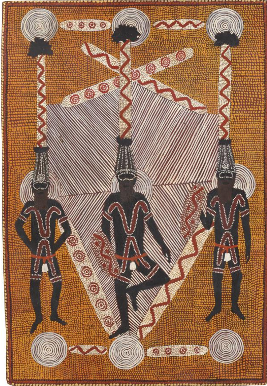
Fig. 1. Clifford Possum Tjapaltjarri, Untitled (Kwaty anganenty rntwem — Rain Dreaming Dance) , 1972. Synthetic polymer paint on composition board, 51 x 35cm, Sydney, private collection.

River Red Gums and later in life he would learn to track them as they made their way to Ironwood trees to graze on their sweet flowers. 3 The antics of the Rrpwamper ancestors are depicted on some of Clifford's most admired canvases, but the painting referred to in this newspaper article featured not possums, but a group of decorated and dancing men.