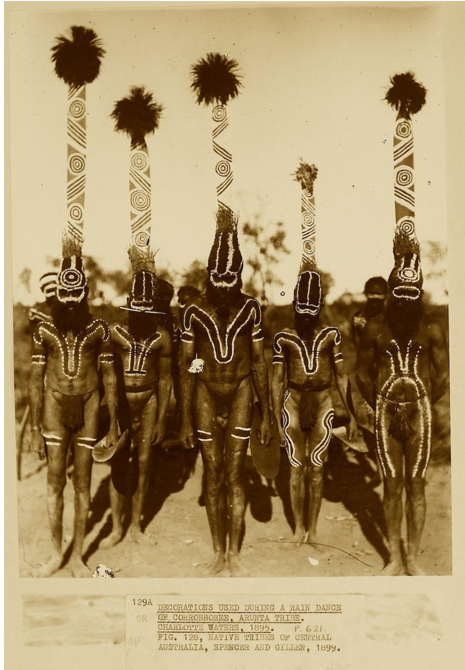
Fig. 2. Francis (Frank) Gillen, Rain dance at Charlotte Waters , c.1895. Glass plate photograph, Melbourne, Spencer Collection Museum Victoria.

While the headdresses, masklike disguises and painted armbands appear to have been derived from the 'rain dance', the shoulder to knee body paint and hair-string belts (replete with tufts of Bilby's tail) are similar to those worn by the Erkita men. We are not suggesting that Possum has slavishly copied the images from Spencer and Gillen's text, rather that he consciously used elements derived from both photographs to construct an