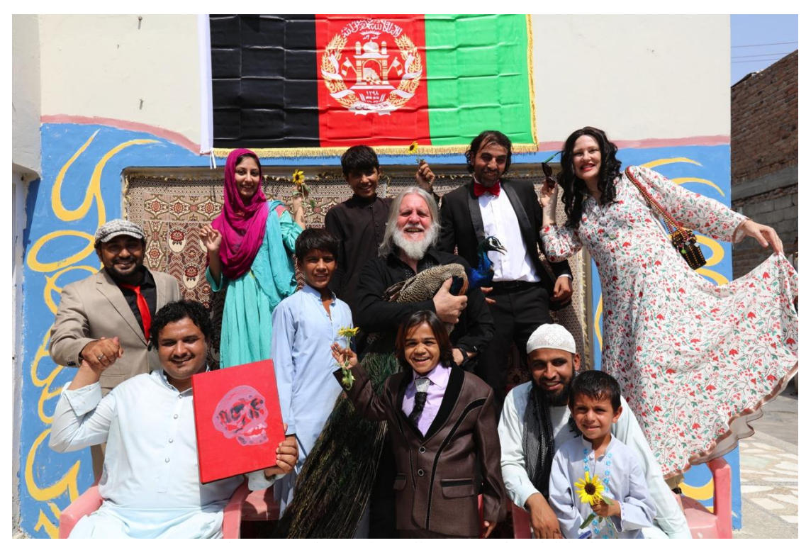
Figure 1. Artists at the Yellow House in Jalalabad