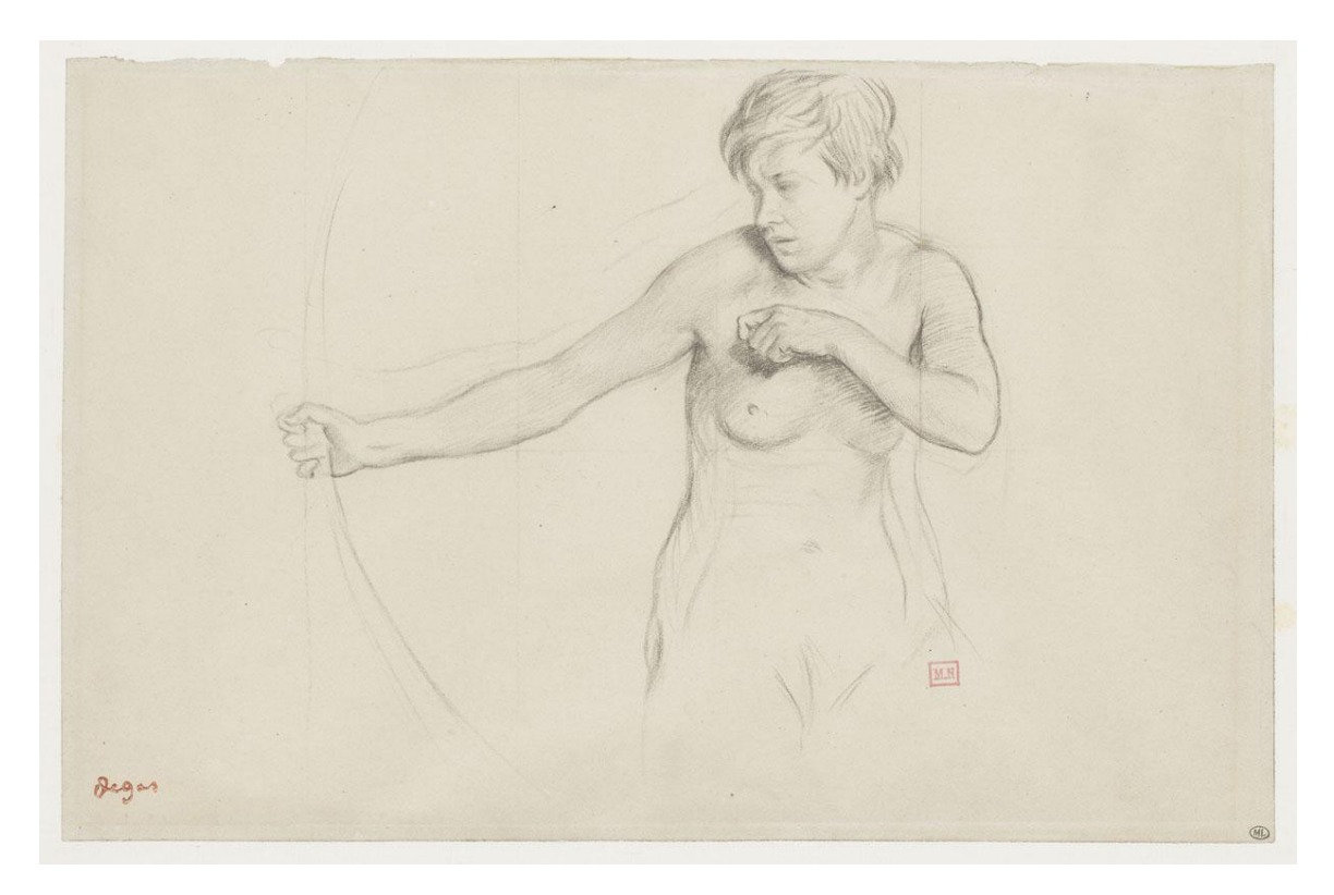
Fig. 6. Edgar Degas, Study for Archer, 1865. Black pencil and estompe on paper, cm 22.9 x 35.6, Département des Arts Graphiques, Musée du Louvre, Paris, RF 15 522.

by Charpentier in four volumes edited by Pierre-Adolphe Chéruel.<sup>58</sup> This edition may have been seen by Degas, and there is no doubt that he would have been familiar with the iconography of the Grande Mademoiselle from both the printed portraits of her conserved at the Cabinet des Estampes and from such works as Jean Nocret's Allegorical Portrait of the Royal Family (1670) in the Salon de l'Oeil de Boeuf at Versailles or Pierre Bourguignon's Portrait of Anne-Marie-Louise d'Orléans Holding the Portrait of Her Father (1671-2) (Fig. 7).