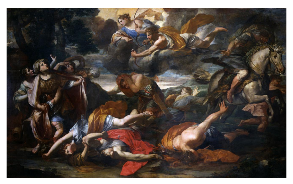
Fig. 5. Charles Dauphin (1620-77), The Massacre of the Niobids , n.d. Oil on canvas, 213 x 350 cm, Galleria Sabauda, Turin.

But why is Mademoiselle shooting at women like herself? This cruel detail has nothing enigmatic or contradictory if we keep in mind that in his piece of historical genre, Degas, through the citation of Charles Dauphin, has suggestively introduced a clear mythological reference to Artemis, the goddess of chastity. As Degas knew, essential to the identity of Artemis the virgin huntress, whose companionship is confined to nymphs, is the fact that she punished brutally the men as well as the women who transgressed the vows of chastity that bound them to her. Degas used both male and female models for the naked figure lying on the foreground to the right-hand side, as well as for the archer in yellow, whom we see in a drawing at the Louvre (Fig. 6).