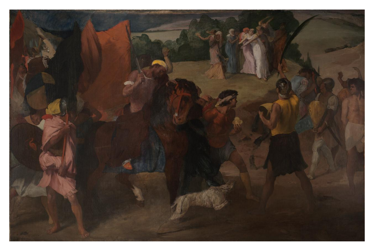
Fig. 1. Edgar Degas, The Daughter of Jephthah , 1859-60. Oil on canvas, 195.6 x 298.5 cm, Smith College Museum of Art, Northhampton, Massachusetts, Drayton Hillyer Fund, SC 1933:9-1.