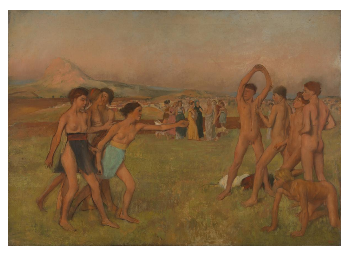
Fig. 2. Edgar Degas, The Young Spartans Exercising , 1860-62. Oil on canvas, 109.5 x 155 cm, The National Gallery, London. Courtauld Fund, 1924, inv. NG3860.

apparent in his history paintings. The theme of the destiny of the exceptional individual, signified by the strong female, emerges as Degas evokes the fate of Jephthah's daughter to remain a virgin, the accomplishments of Queen Semiramis, thriving in her newlyfound unmarried state, and the bellicose Mademoiselle d'Orléans whose dreams of marrying Louis XIV are dismantled by her going to war.