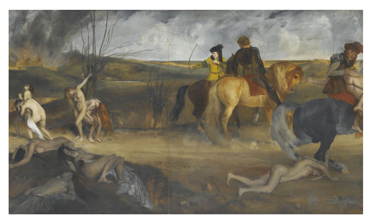
Fig. 4. Edgar Degas, Scene of War in the Middle Ages , 1863-65. Peinture à l'essence, 145 x 83 cm, Musée d'Orsay, Paris.

My purpose in the second part of this paper is to relate the so-called Scene of War in the Middle Ages (Fig. 4) to Degas' other history paintings. Considered cryptic by most scholars, this piece of historical genre may in fact represent Mademoiselle d'Orléans, also known as Mademoiselle de Montpensier. The unmarriageable Mademoiselle d'Orléans, frondeuse, amazone and autobiographer, would fit comfortably alongside Semiramis and Jephthah's daughter as an exemplary life that Degas appropriated as an alter ego for the artist as exceptional being.