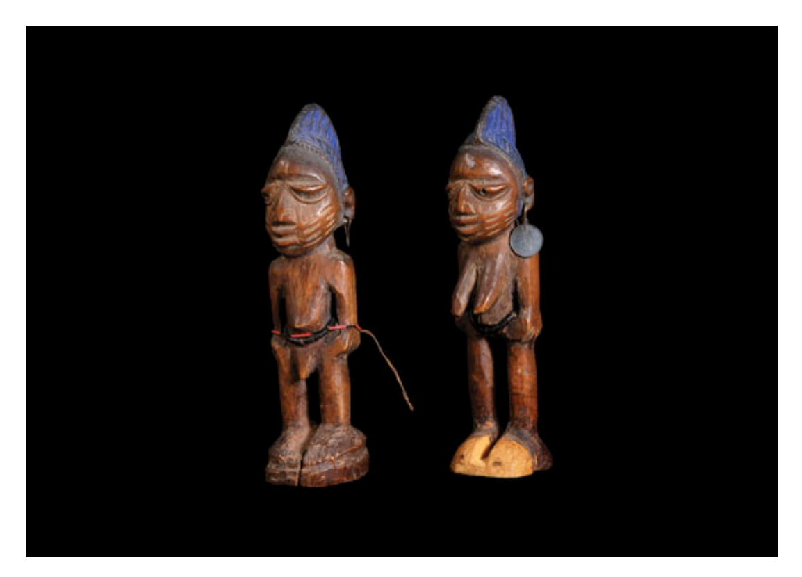
Fig. 7. Unknown Yoruba artist (Nigeria), Ìbejì Figures , date unknown. Mixed media, dimensions unknown, Otago, Joel A. and Patricia H. Vanderburg collection.

or to their earthly representatives when dead, the ère ìbejì . The sacrifice, by exiting the circuit of worldly exchange and appealing to an interchange with spiritual beings, attempts to transpose and signify the power of twins in a way that reconciles and incorporates that power into the realm of human ritual practice. By opening commerce between the sacred and profane realms on behalf of the twins, the sacrifice restores a sense of meaningful equilibrium to the community confronted with the twins and their disruptive potential.