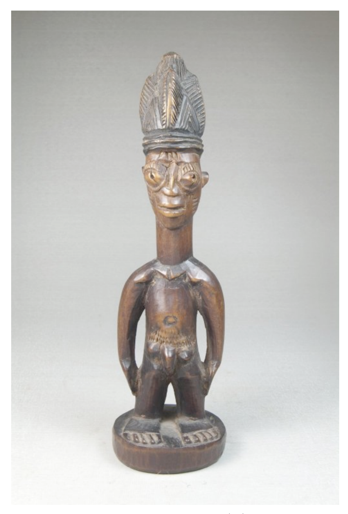
Fig. 2. Unknown Yoruba artist (Nigeria), Standing Male Figure (Ère Ìbejì) , late 19th or early 20th century. Wood, 24.5 x 7 cm, Brooklyn Museum, Robert B. Woodward Memorial Fund, inv. No. 22.1459.