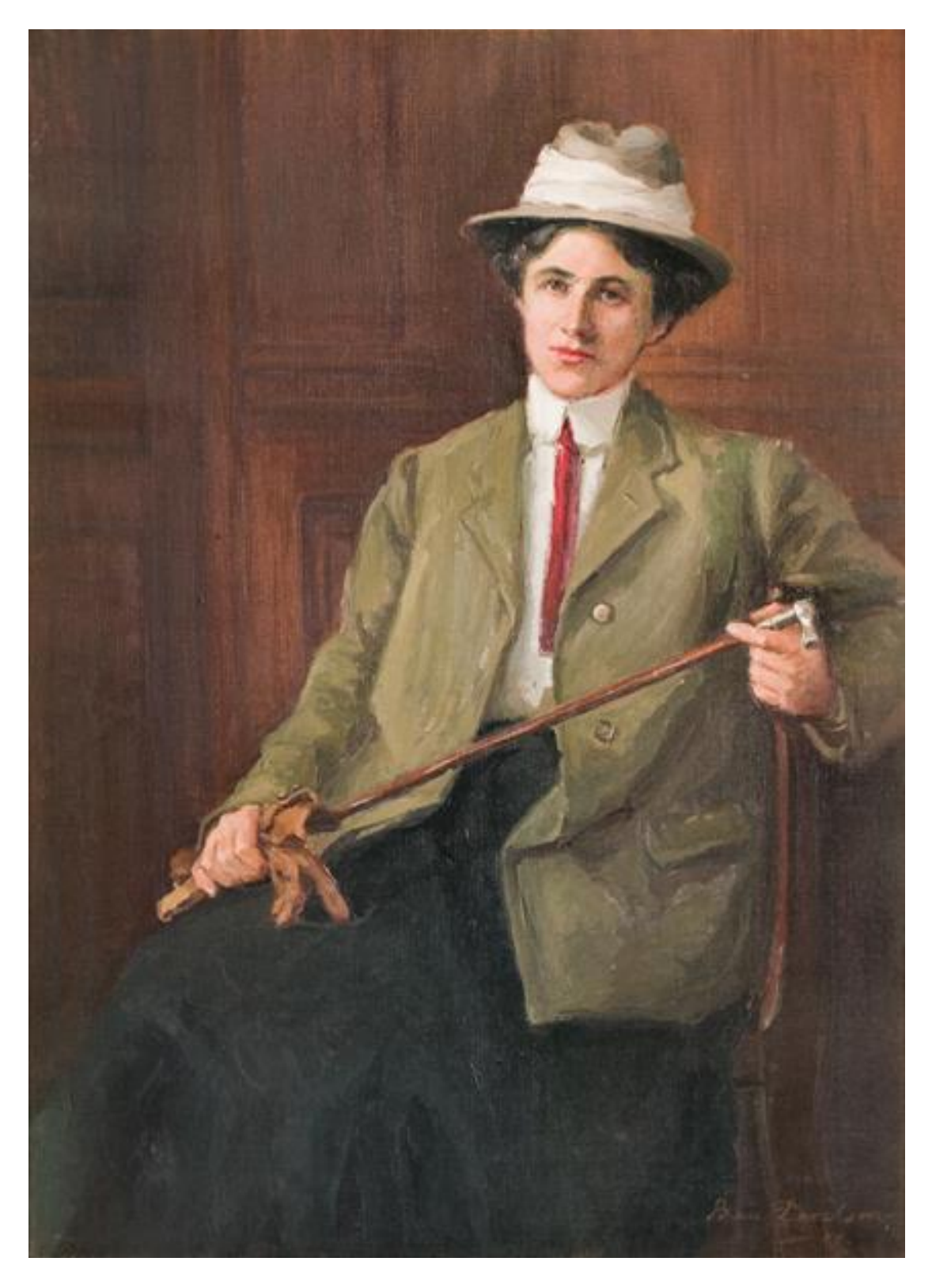
Fig 3. Bessie Davidson, Portrait of Miss G.R. , 1906. Oil on canvas, 125 x 88 cm, Adelaide, Art Gallery of South Australia, Elder Bequest Fund.