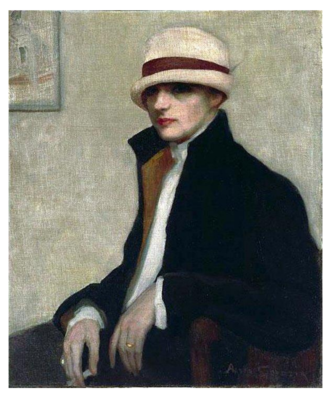
Fig. 4. Agnes Goodsir, The Parisienne , 1924. Oil on canvas, 61 x 50.1 cm, Canberra, National Gallery of Australia. Purchased 1993.

1912 would be repeated some 15 years later when Dorrit Black joined Anne Dangar and Grace Crowley in that city. It is a matter of record that it was women who sought to record and preserve expatriatism as an artistic possibility for all Australians.