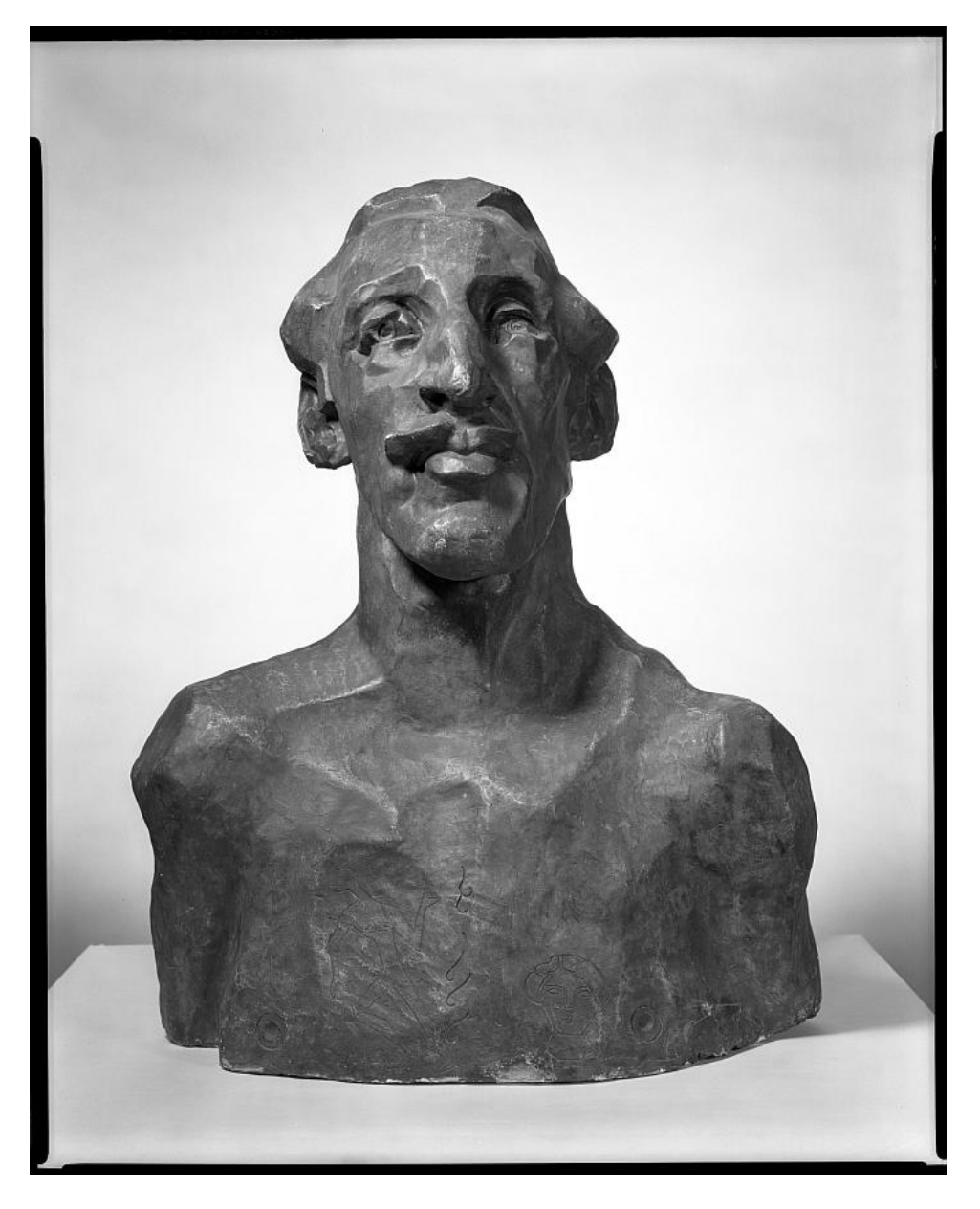
Fig. 6. Henri Gaudier-Brzeska, Bust of Horace Brodzky , c. 1913. Plaster, 71.2 x 53.34 x 26.67 cm, Harvard Art Museums, Fogg Art Museum, Alpaeus Hyatt Purchasing Fund, inv. No. 1964.36.

exhibition P.G. Konody, later to be the London buyer for the National Gallery of Victoria's Felton Bequest, selected his painting Girgenti – The Pine Tree (1911) for the 1912 Venice Biennale, where he was identified, of course, as British, although, from an UnAustralian point of view he was the first Australian artist to exhibit at this important international spectacle. The following year, he became close to the early modernist sculptor Henri Gaudier-Brzeska (also at this time a friend of the New Zealand expatriate author Katherine Mansfield), and more importantly became 'both the first Australian artist and the first artist in Great Britain to do a linocut'.<sup>46</sup> This linocut technique leads in two directions, one back to Australia and the other right to the heart of European modernism. On the one hand, it is a technique taken up by the English artist Claude Flight, who was to go on to have a lengthy and celebrated