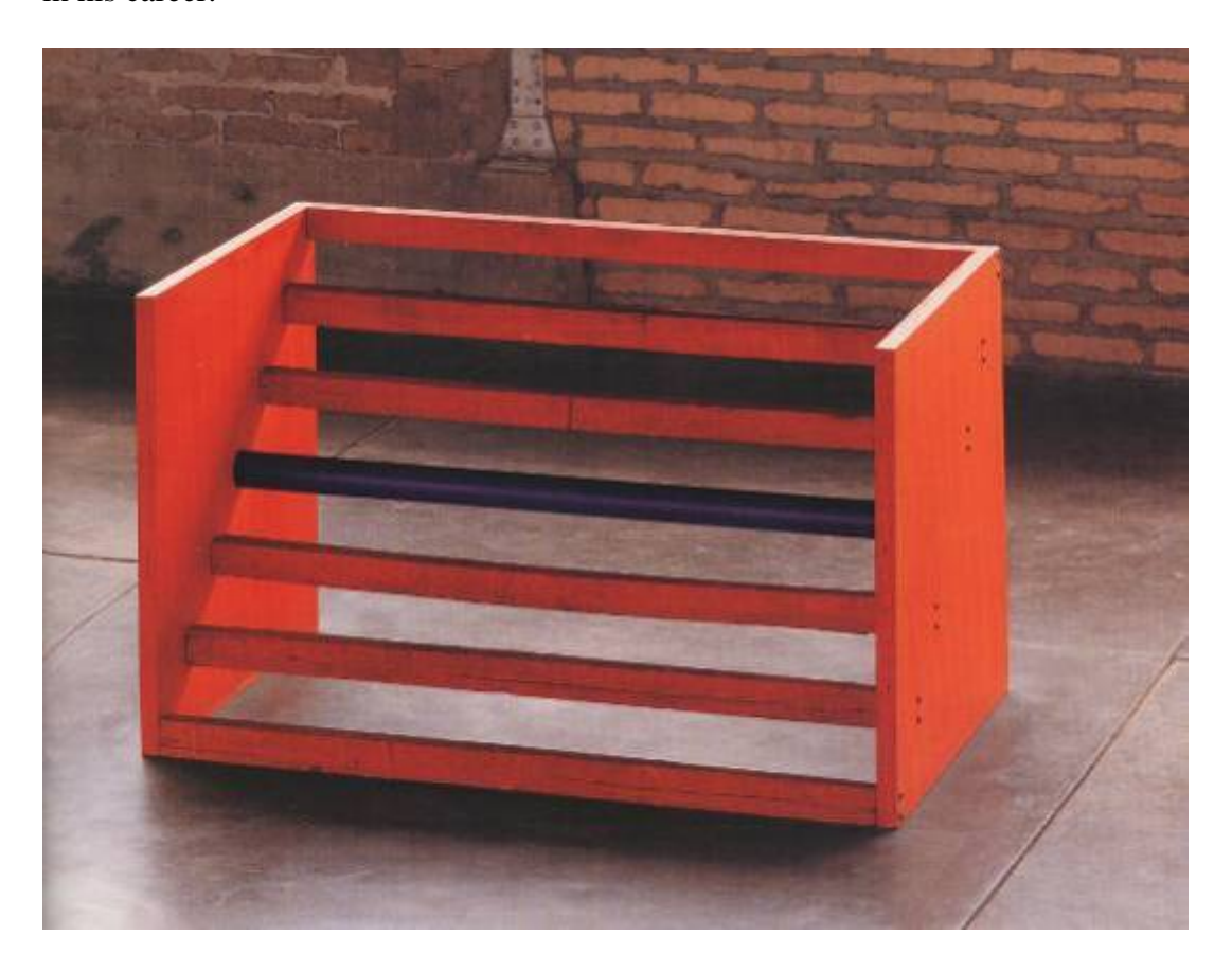
Fig. 3. Donald Judd, Untitled , 1963. Light cadmium red oil on wood and purple lacquer on aluminium, 12.2 x 21 x 122 cm. Photo by Todd Eberle. (© Donald Judd/VAGA. Licensed by VISCOPY 2009.)

is still clearly anti-modernist in the Greenbergian sense, in that he repeatedly uses the generic term 'art' when discussing the visual arts. On the other hand, unlike in 'Specific Objects', he does explicitly discuss 'architecture' and uses this disciplinary term alongside the generic 'art' throughout the paper. It is possible that Judd himself would have also differentiated between art and architecture during the 1960s, but equally that his rejection of Greenberg's modernism bound his early arguments fairly tightly to a notion of generic art over disciplines. As a result and despite its widely acknowledged architectural themes, Judd makes no mention of the disciplinary term 'architecture' in 'Specific Objects' and perhaps therefore avoids undermining the essay's anti-Greenbergian agenda. <sup>16</sup> Furthermore, by the 1990s, Judd had been working at Marfa for over a decade and his considerable involvement with interventions to existing buildings within the town during this time may have played some part in his more explicit consideration for architecture in relation to the arts later in his career.