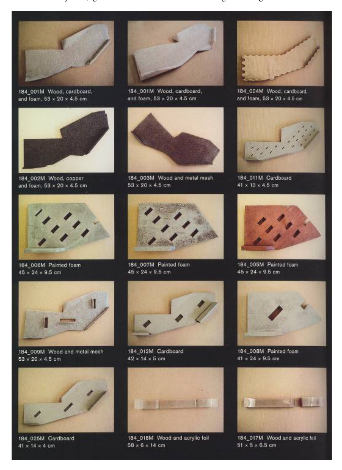
Fig. 2. Herzog and de Meuron, Study for Project No. 184 , Prada le Cure, Production Centre and Warehouse, Terranuova, Arrezzo, Italy, 2000 – 2001. Source: Philip Ursprung (ed.), Herzog & De Meuron: Natural History , Montréal and Baden: Canadian Centre for Architecture and Lars Müller Publishers, 2002, p. 266. (© Herzog & de Meuron.)