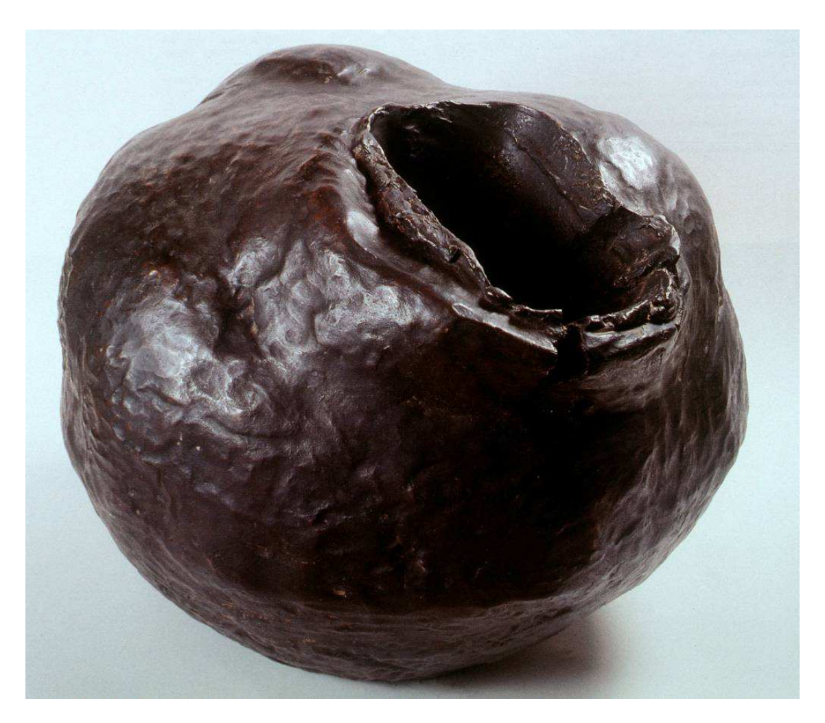
Fig. 2. Lucio Fontana, Spatial Concept: Nature , 1959 – 1960. Bronze, 67 x 80 cm. Rome, Private collection.

of different openings. The following year he began casting the same works in bronze [Fig. 2]. These sculptures, which resemble enormous, over-ripe fruit, strongly engage with the viewer's experience of the body. When standing close to these colossal balls of mud or metal, their torn-open holes yawn ominously at the viewer. By literally opening up his sculptures Fontana created a profoundly visceral relationship between the work of art and the viewer's body. However, this relationship was anything but affirming of the viewer's sense of self.