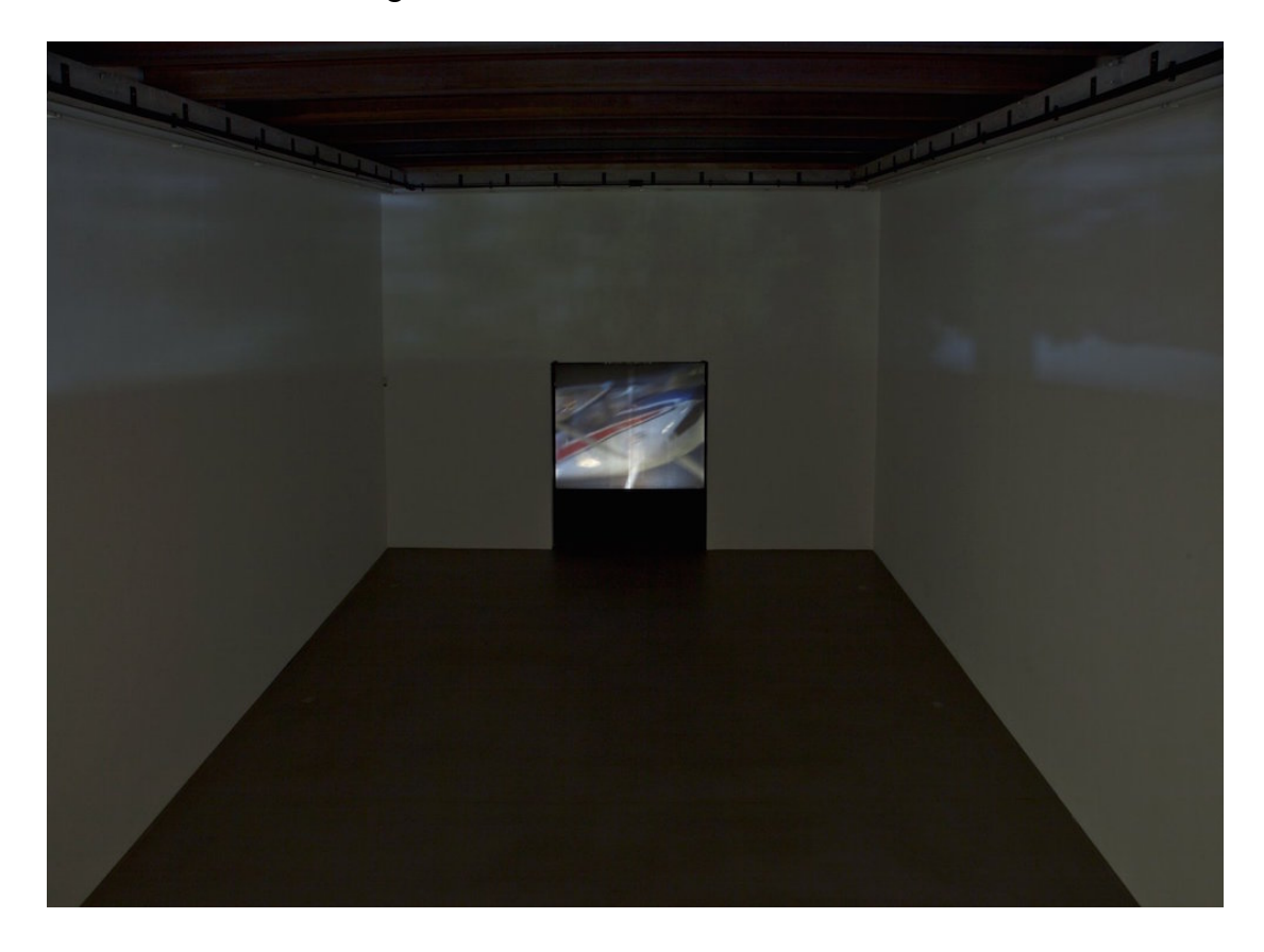
Figure 1. Michael Stevenson, A Life of Crudity, Vulgarity, and Blindness , 2012 (detail). Plexiglas, cardboard, wood, steel, mirror, buttermilk, sunlight, 16 x 8 x 17m. Installation at Portikus, Frankfurt am Main.