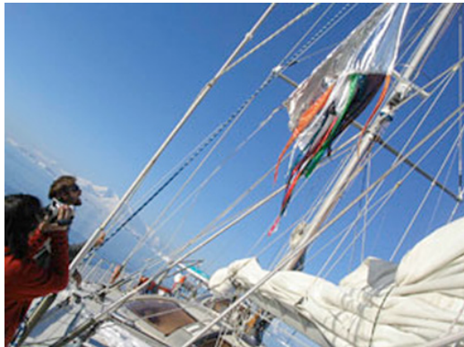
Fig. 2. Aleksandra Mir, Antarctica , 2005, Image from Mir's website. Image courtesy of the artist.

Antarctica 2005 (Fig. 2): From February to March this year Mir and a group of friends and strangers sailed from Argentina to Marguerite Bay situated below the Antarctic Circle.