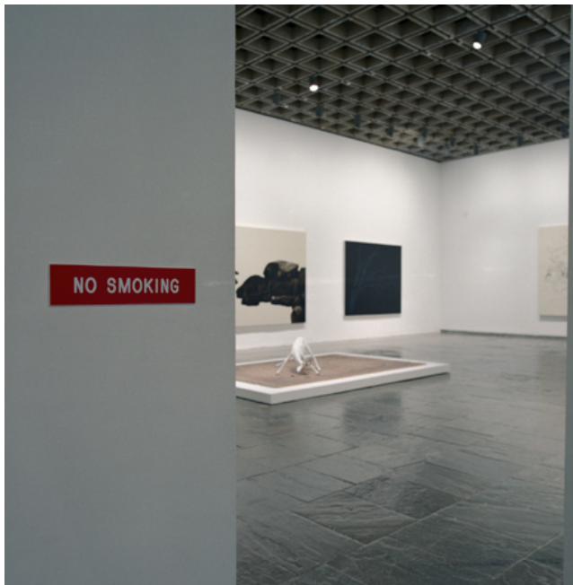
Fig. 3. Aleksandra Mir, No Smoking , 2004, as installed at the 2004 Whitney Biennial.

No Smoking , 2004 (Fig. 3): 16 plastic No Smoking signs were installed in the galleries of the Whitney Museum for the 2004 Whitney Biennial. Mir writes—‘I wanted to make something that could breathe the air of the collective tension by negotiating a place with the other pieces there.