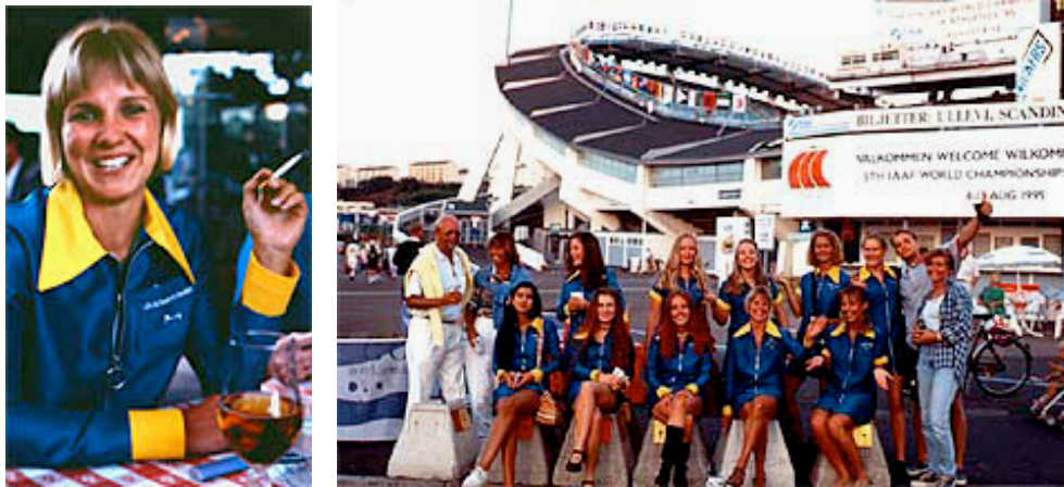
Fig. 5. (Left) Aleksandra Mir, Life is sweet in Sweden (Anna) , 1995. Image courtesy of the artist. Fig. 6. (Right) Aleksandra Mir, Life is sweet in Sweden (Hostesses) , 1995. Image courtesy of the artist.

The four examples I have shown fall under the rubric of Bourriaud's collaborations and contracts—where artists propose as artworks (a) moments of sociability and (b) objects producing sociability. 11 Though Bourriaud focuses on institutional collaborations—specifically those between an artist and art dealer, or artist and curator—collaborations and contracts is a practical maxim capable of enduring the most rigorous of critiques, such as that by Claire Bishop. Where 'what the viewer is supposed to garner from such an "experience" of creativity, which is essentially institutionalised studio activity, is often unclear'. 12 Without saying as much, Bishop is questioning the artists' and Bourriaud's motive. By pointing out that Bourriaud 'is at pains to distance contemporary work from that of previous generations' Bishop further demonstrates that if a conventional art historical or art critical approach is employed to articulate the faults of, and the general misgivings towards Bourriaud's observation—such as reflecting on previous generations of performance artists—then the possibility of Relational Aesthetics becoming a new direction in which artists can create socio-political art free from the self-conscious activism of post-modernism, will continue to be dismissed as contemporary art fashion, depending on how one wishes to discriminate.